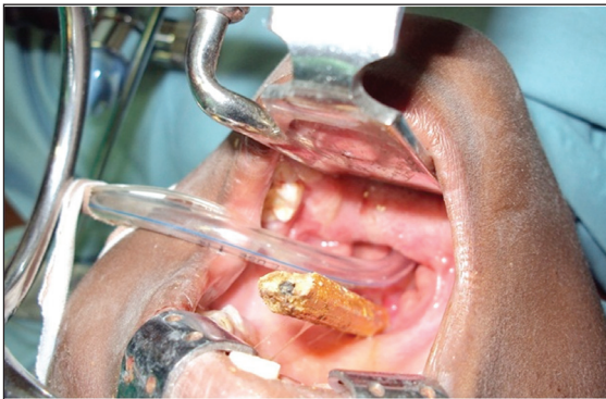
Figure 3. At operation, showing the point of entrance of the pencil.