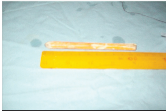
Figure 5. About 7-cm length of the pencil penetrated.