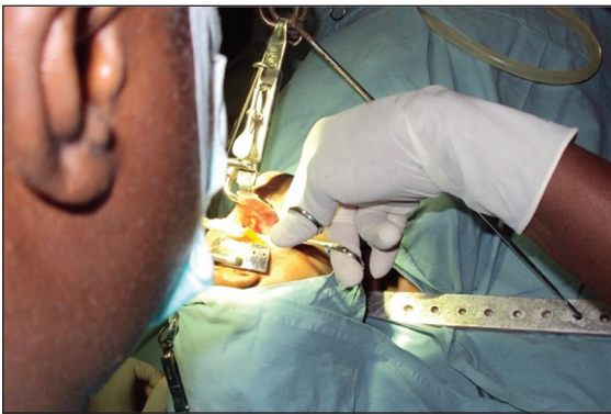
Figure 4. The pencil grabbed with forceps, gently disimpacted and removed.

point of entrance. The pencil was grasped with short foreign body forceps (Figure 4) and gently disimpacted and removed. About 5 mL leakage of cerebrospinal fluid was observed. Firm digital pressure was applied while the stay sutures were then knotted to close the opening. About a 7-cm length of the pencil was embedded (Figure 5). The immediate postoperative condition was satisfactory. Intravenous antibiotics were continued