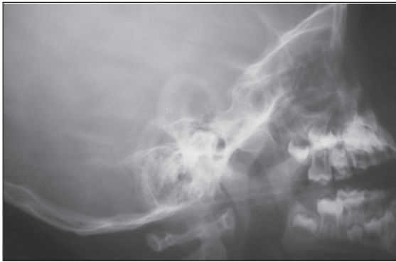
Figure 2. Pencil extending from oral cavity to skull base.