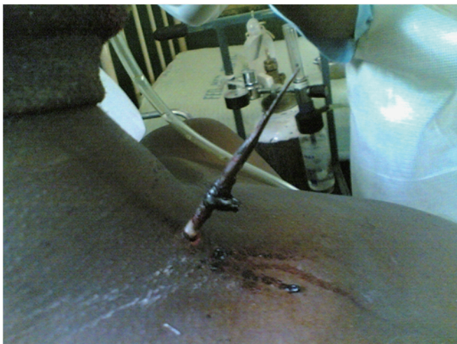
Figure 2. Side view of the neck with the arrow in-situ.

At surgery, a 6 cm para-sternocleidomastoid incision was made on the skin with the entrance point of the arrow at the mid-point. The incision was deepened down and dissections done to reach the barbed end. The arrow lied in the right trachea-esophageal groove with the pointed end slightly buried in the wall of the esophagus. There was a 2 cm laceration on esophageal wall into the muscle but the mucosa was intact. Also the pre-tracheal fascia was bruised. The esophageal wall laceration was repaired in layers. No injuries to the great vessels of the neck. The wound was thoroughly irrigated with normal saline and closed in layers. A nasogastric tube (NG tube) was inserted intra-operatively.