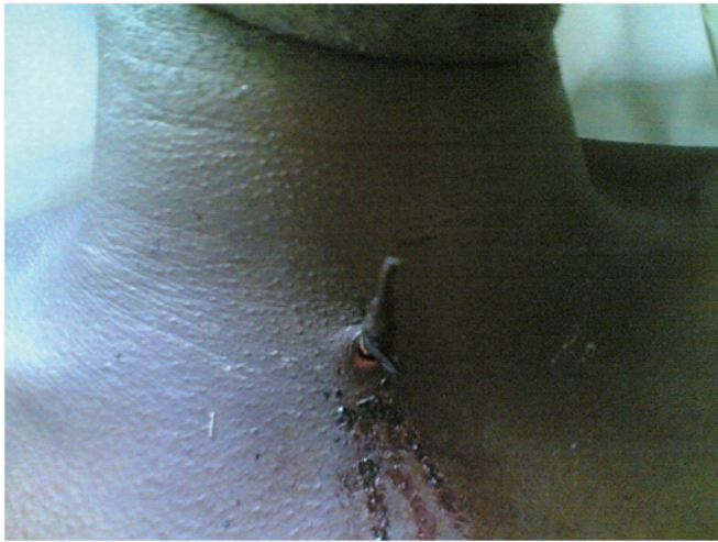
Figure 1. Anterior view of the neck with the arrow in-situ sealing the wound.

He was commenced on intravenous fluid, cefuroxime and metronidazole. 2 units of blood was cross matched for him and he was planned for urgent anterior neck exploration and foreign body removal under general anesthesia.