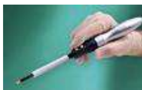
Fig. 5. Harmonic/ultrasonic scalpel.