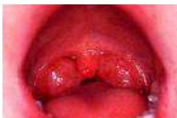
Fig. 1. Orophaynx with Palatine Tonsils.

The tonsils are well vascularized with the majority of the blood supply arising from the tonsillar branch of the facial artery. 1 The nerve supply of the tonsils arise from the ninth cranial nerve and descending branches from the lesser palatine nerves and the tympanic branch of CN IX is thought to account for the referred ear pain found in some cases of tonsillitis. The tonsils have no afferent lymphatic vessels. Their efferent lymph drainage is through the upper cervical nodes, especially to the jugulodigastric group. Tonsils and adenoids are immunologically most active between the ages of 4 and 10 years, and tend to involutes after puberty. 2