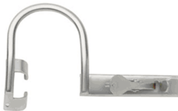
Fig. 2. Open-sided mouth gag (Davis Mouth Gag).

For a successful surgery, adequate exposure, of the oro-pharynx must be achieved. Also knowledge of the relevant anatomy and tissue tension is important. With the aid of a mouth gag, e.g, Boyle -Davis (Figure 2), the oropharynx is exposed. Dentition may be protected by a plastic or rubber athletic mouth guard and careful mouth gag placement. Care is taken not to allow the lateral flanges of the tongue blade of the gag to scratch dental enamel. Protection of the mucosa from electrical and thermal conductivity is achieved by interposing a gloved finger between the instrument metal and the patient. 13