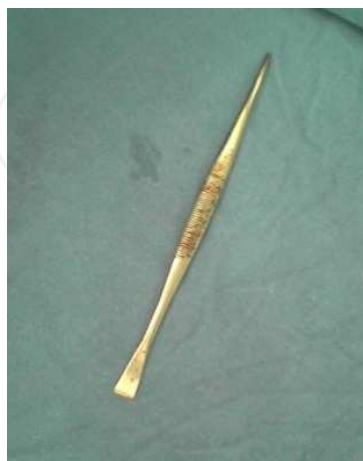
Fig. 4. Tonsil Dissector.

A frequently used method for total tonsillectomy is the “cold” or sharp dissection technique. In this technique, the tonsil and capsule are dissected from surrounding tissue using scissors, knife, or tonsil dissector (Figure 4) and the inferior pole is amputated with a tonsil snare.