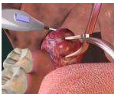
Fig. 3. Medial Traction on the Tonsil.

The tonsils are then removed using 1 of the techniques described later.