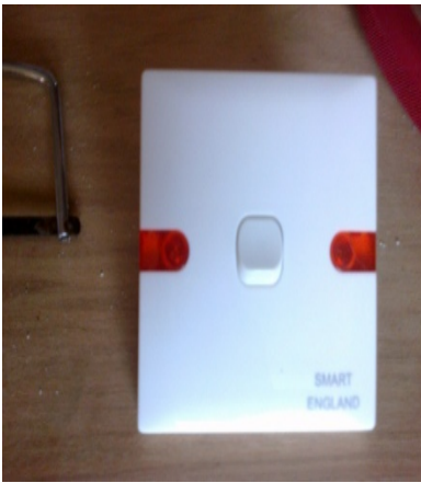
Fig. 4: Switch