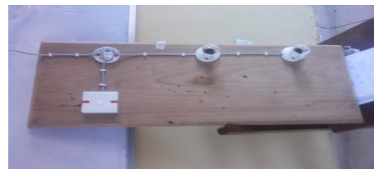
8: Wiring of Lighting Points in Parallel

The bulbs will come on and will produce a very bright illumination. This is because the bulbs do not share the same current.