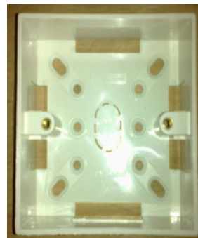
Fig. 3: Pattress Box