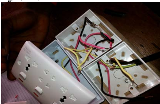
Fig. 10: Internal Structure of an Extension Box

After the successful completion of the Electrical project, extension box was constructed as shown in fig. 11 also, light were wired through series and parallel connection and at the same time, components were successfully assembled and soldered shown in Fig. 10 11 and 12.