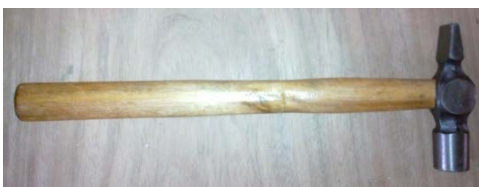
Fig. 1: Hammer