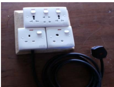
Fig. 11: Constructed Extension box