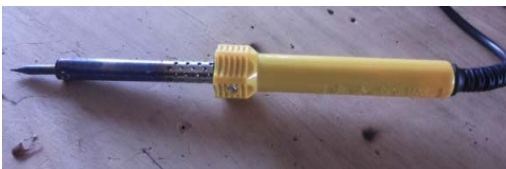
Fig. 7: Soldering Iron