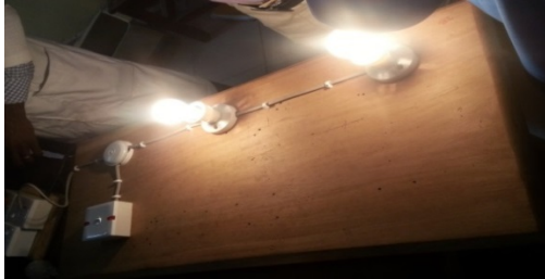
Fig. 9: Wiring of Lighting Points Serially

When this is done, all wires were tightly fixed to the board using clips and then the bulbs are inserted into the lamp holders. The two wires that were out of the junction box are then connected to the socket, then, the switch is put on. The bulb will come on but will produce a very low illumination. This is because both bulbs share the same current.