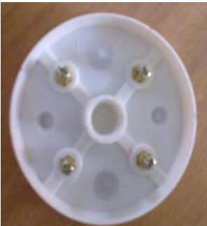
Fig. 5: Junction Box