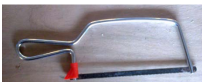
Fig. 2: Hand Saw