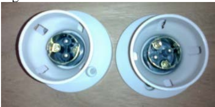
Fig. 6: Lamp Holder