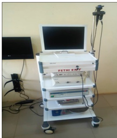
Figure 1: Xion Flexible Fiber-optic nasopharyngolaryngoscope with video monitoring

The development of flexible endoscope has increased both the diagnostic and therapeutic indications in clinical practice, [2] with the advantage of its simplicity in usage [3] and the need for only local anesthesia. Fiber-optic imaging was initially developed in the 1930s by a medical student named Heinrich Lamm who intended to visualize inaccessible regions of the body with his invention. Fiber-optic imaging became more visible in the medical literature during the 1950s with further innovations by Hopkins and Storz. [4] By 1963, Hirschowitz designed a medically functional fiber-optic scope with higher resolution, lighting, suction, and instrument ports. [5] Current fiber-optic nasopharyngoscopes are lighted, are flexible with 2-way articulation, provide inline viewing with photo and video capabilities, and can have a distal diameter as small as 2 mm. Endoscopes with calibrations provide useful sizing information for laryngeal structures. [6,7,8] and help in determining the extent of airway lesions. [7,8]