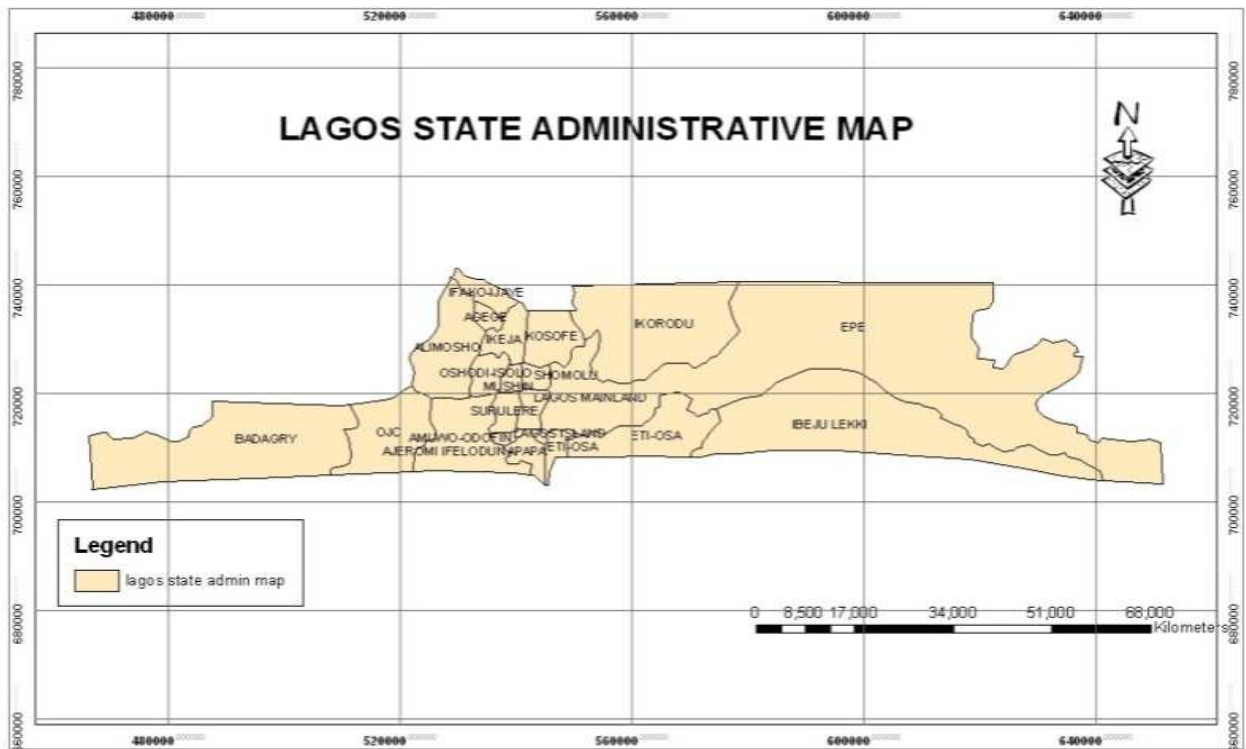
Figure 1. Lagos State Administrative Map

the Atlantic Ocean. Lagos State is in terms of geography arguably the smallest State in Nigeria. Lagos is one of the six states that make up Nigeria's South West geopolitical zone. It shares an international boundary with the Republic of Benin to the southwest and has an interstate boundary with Ogun State (LSINGO, 2011). The Bight of Benin lies to its south. Its capital is Ikeja. Figure 1 shows administrative map of the state and Figure 2 indicates the map of Lagos state.