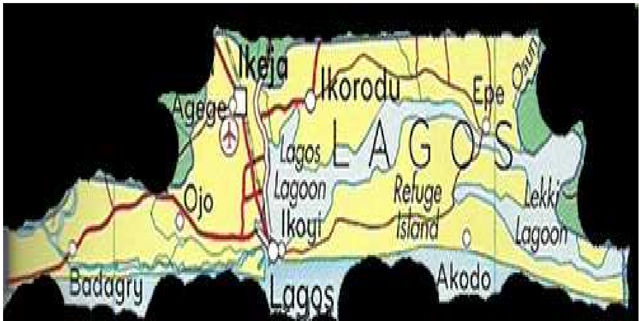
Figure 2. The map of Lagos state